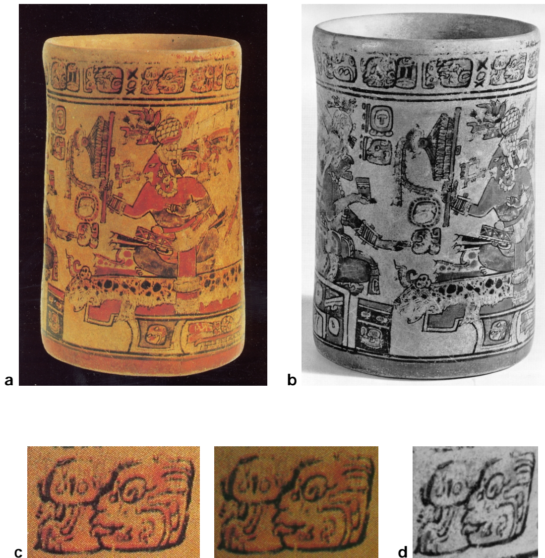
Figure 3: Vessel at the Rietberg Museum, Zürich, Switzerland (RMA 314), a) Color Still Photograph (after Eggebrecht and Eggebrecht 1992: No. 83), b) Black-and-White Still Photograph (after Haberland 1971: No. 62), c) Two High Resolution Color Scans (by the author), d) High Resolution Black-and-White Scan (by the author)

This particular spelling variant is very rare in Maya hieroglyphic writing and to my knowledge has not been identified in previous epigraphic research. The example on Kerr No. 1211 is, however, not unique. The second example can be found on a Late Classic Maya vessel now part of the collection at the Museum Rietberg in Zürich, Switzerland (Figure 3).