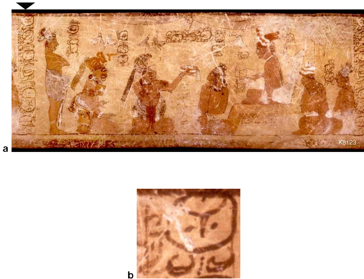
Figure 1: Kerr No. 8123, a) Rollout Photograph by Justin Kerr, b) Detail of the “Initial Sign” spelled ‘a-la-ya (high resolution image by Justin Kerr)

Within a corpus of currently over 600 different PSS texts (and growing in number) there are actually three examples in which the “Initial Sign” is written ‘a[la]-LAY? or ‘a[la]-LAY?-ya . Unfortunately I have at present no permission to illustrate one example, as it is found on a vessel in a private collection.