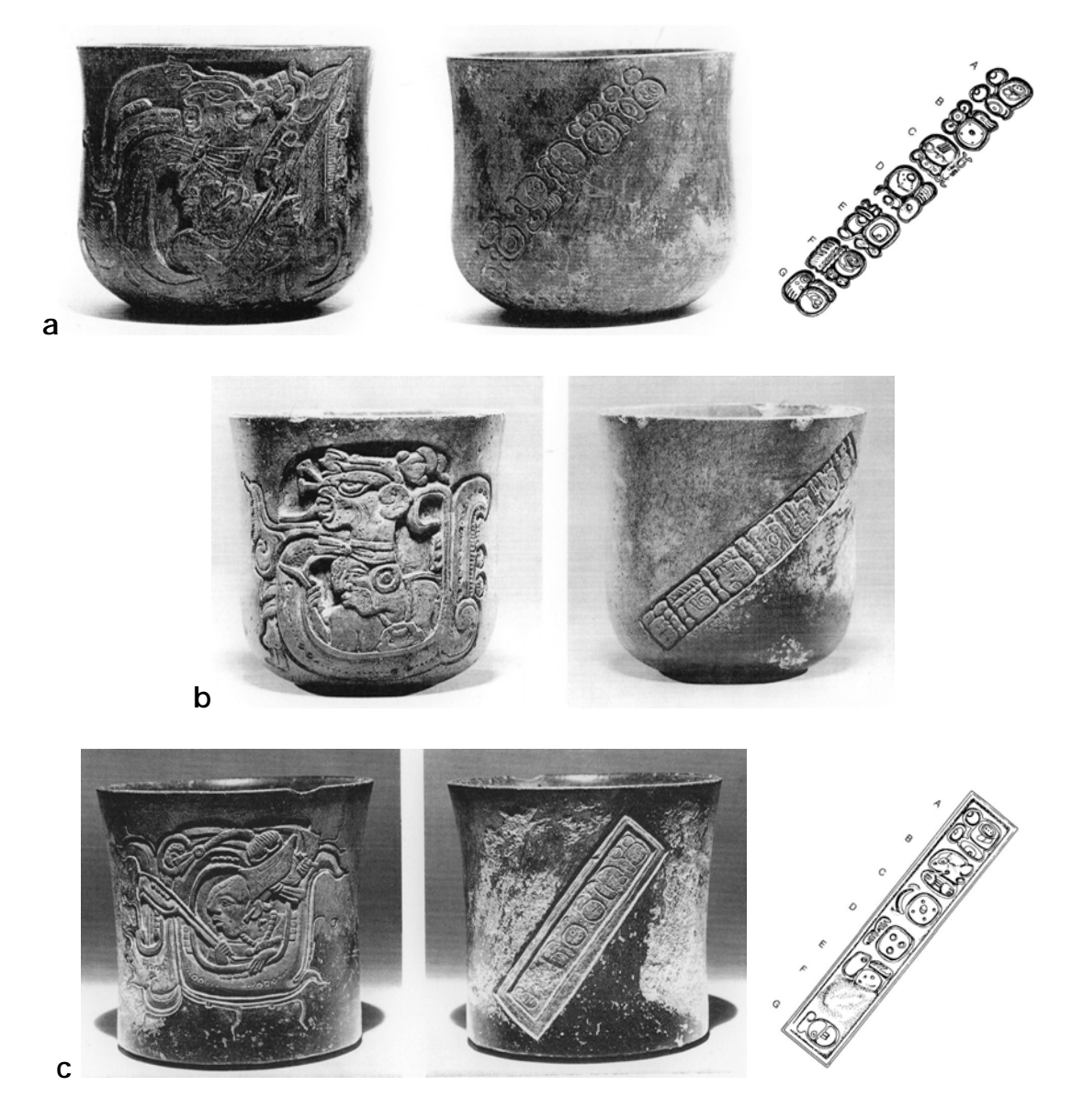
Figure 3: Vessels that depict a Male Human Upper Torso inside a Water Lily Cartouche, a) Coe 1973: Cat. No. 59, b) Coe 1973: Cat. No. 60, c) Coe 1973: Cat. No. 61

Three of these vessels depict a male human upper torso within a water lily cartouche, holding a (long or short) water lily stem (Nos. 59, 60, & 61) (Figure 3).<sup>2</sup> However, none of these vessels are the same as the Spinden and Dieseldorff vessel as pertinent details in the portraits, Water Lily Jaguar headdresses, and the cartouches or medallions differ. If my identification is correct, the M. Louise Baker drawing is at present the only record of the hieroglyphic text of the Dieseldorff vessel. This text would be found on the opposite side of the male human upper torso and would have been placed diagonally.