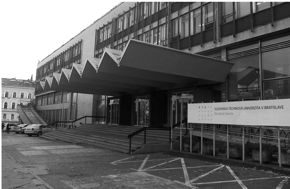
Faculty of Civil Engineering, STU, Entrance from Imricha Karvaša street

From Bratislava Airport: Bus n. 61 to the Main train station, then tram n. 1 to “STU”