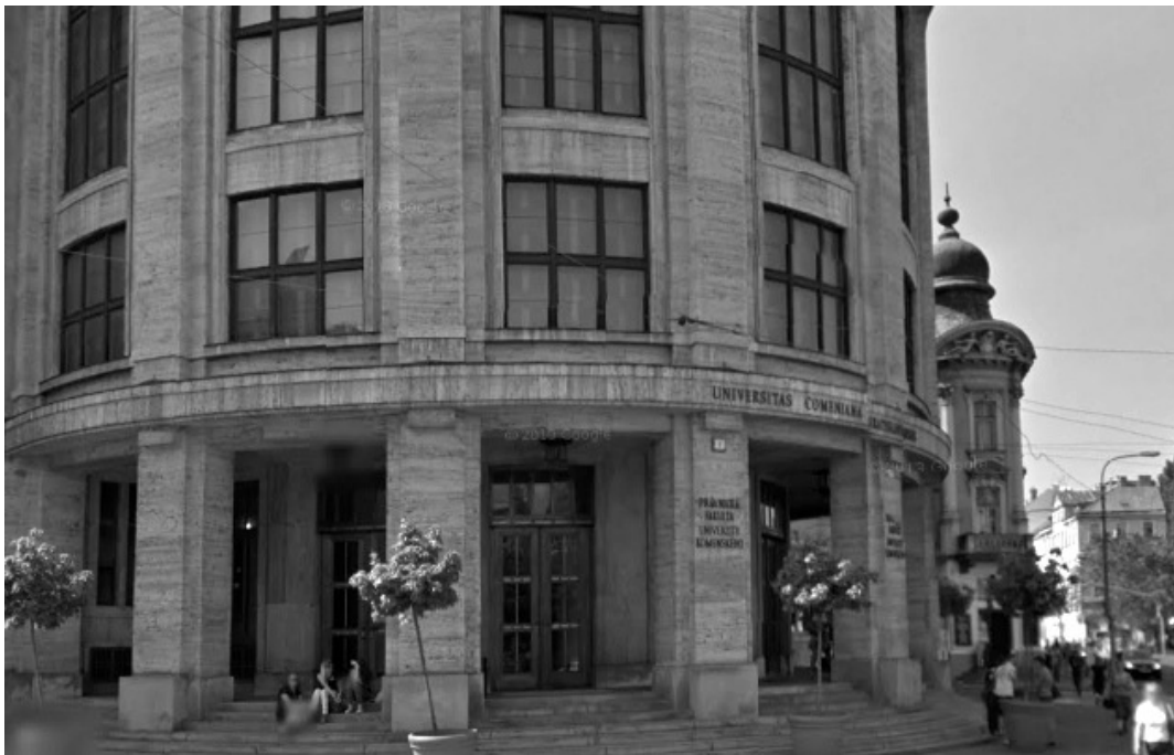
Comenius University, Šafárikovo nám. 1

From Bratislava Airport: Bus n. 61 to the Main train station, then bus n. X13 to “Nové SND”