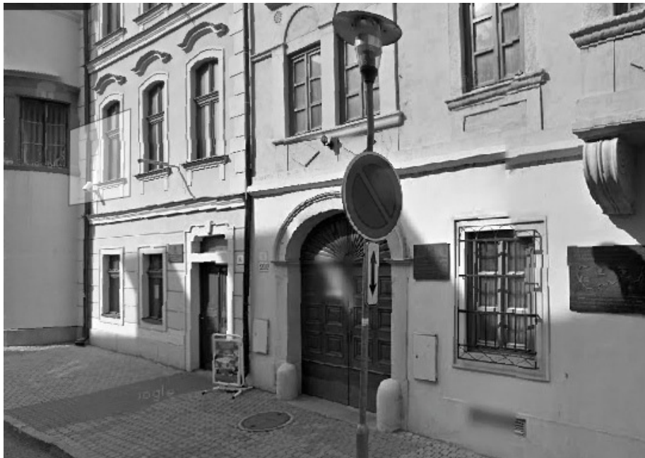
Entrance to the SNM - Museum of Archaeology, Žižkova 16

The museum is accessible by car, so you can also take a taxi .